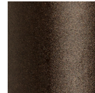
BROWN BRONZE 390