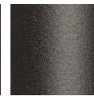
WARM GRAPHITE 180